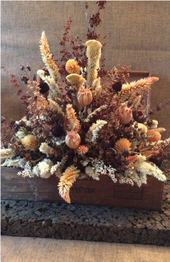
A massive dried arrangement by Grace Starret!