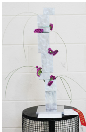
Design by Helga Fontus.