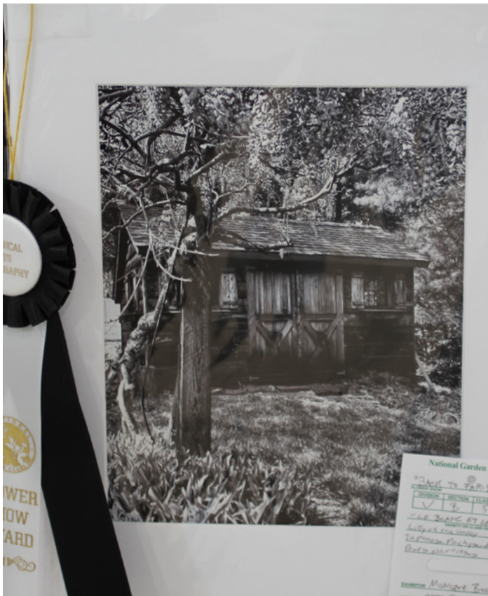
Black and White