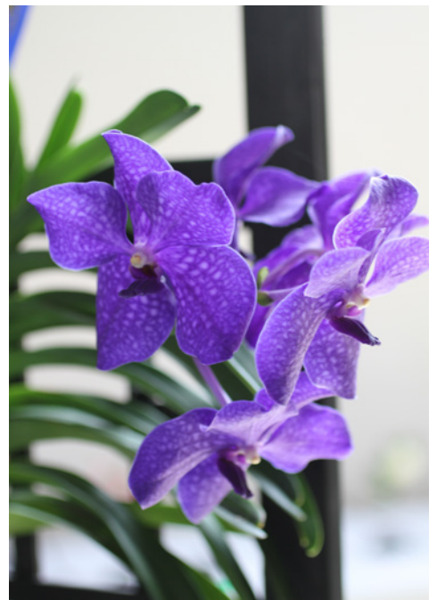
"Back to Paris!" Flower Show photos by Jeff Tryon.