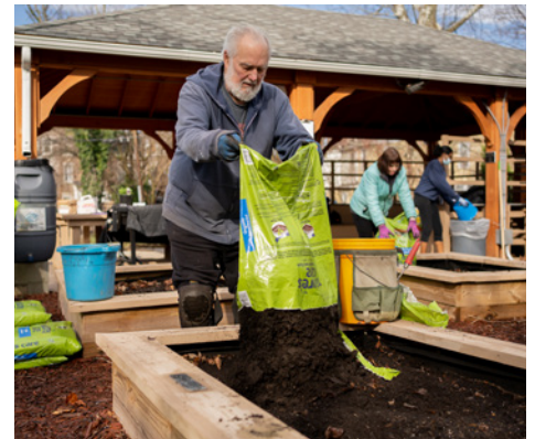
WTGC helps out at the garden for the Boys and Girls Club of Trenton.