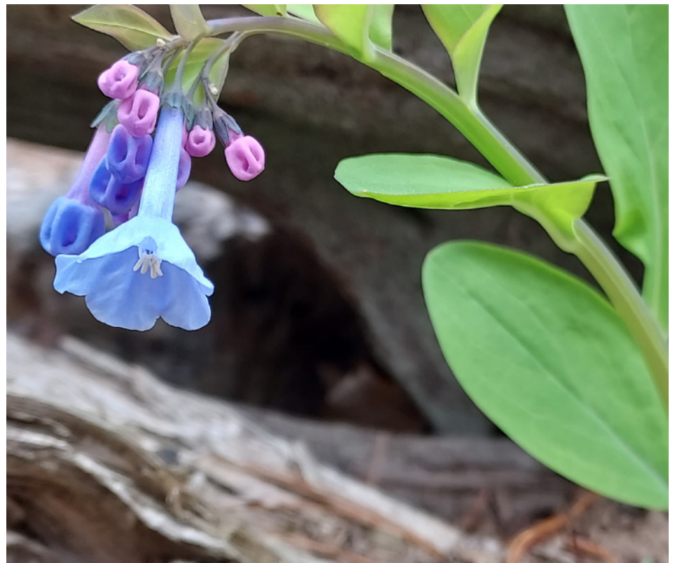
Virginia Bluebell