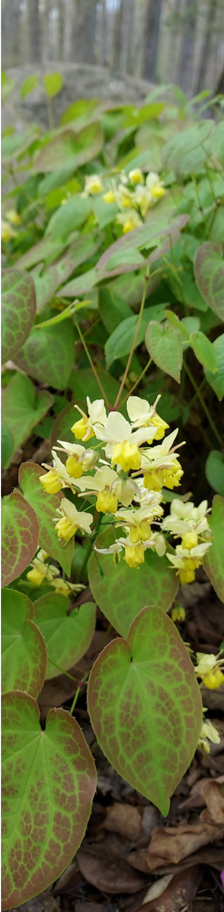
Epimedium, photo by Jeff Tryon.