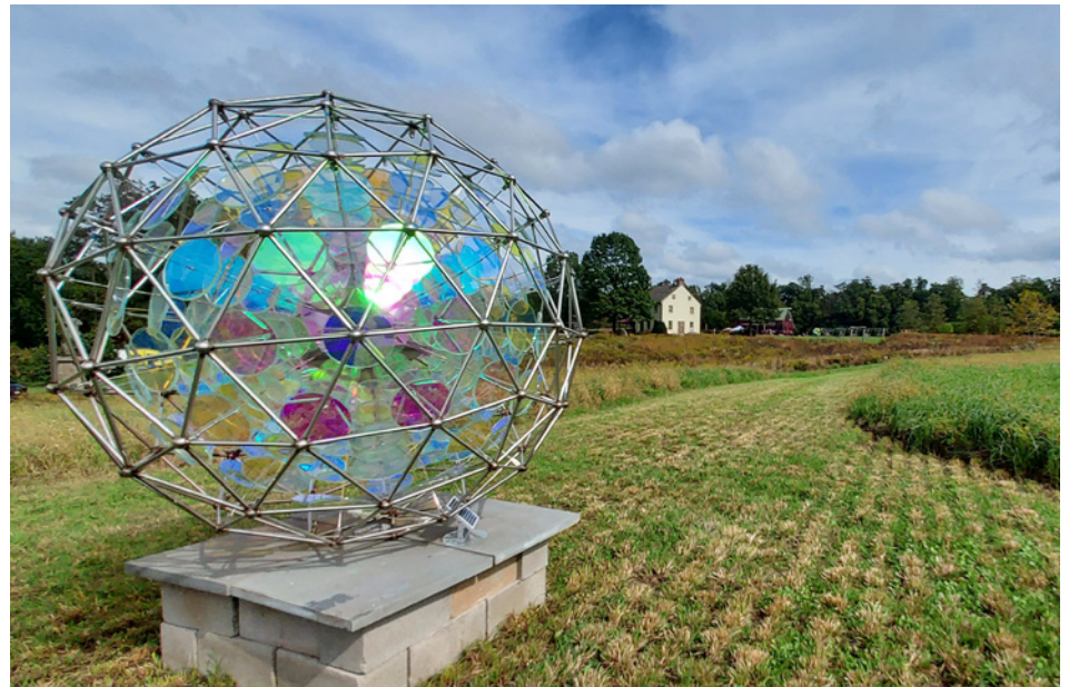
"ART IN THE NATIVE LANDSCAPE" at the HoBART art show in October in Frenchtown.