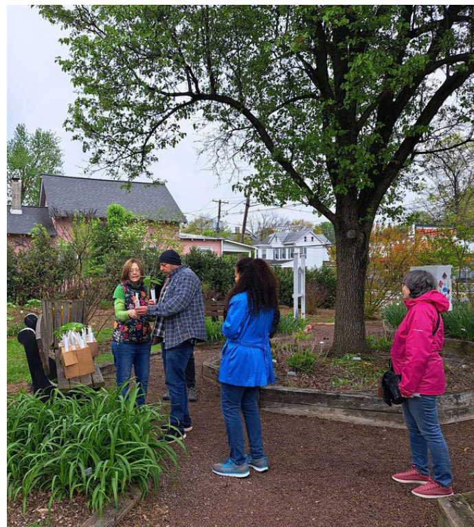
Club members distributing seedlings on Arbor Day. Details next page.